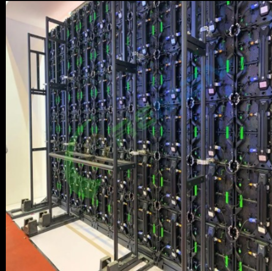
Free standing ground stack?