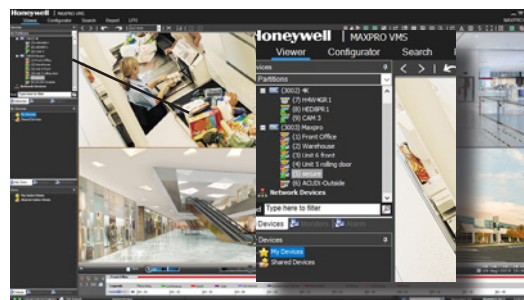
MAXPRO VMS Client Viewer 2x2

MAXPRO VMS is ideal for facilities requiring at-risk critical infrastructure protection such as airports, seaports, large multi-site commercial buildings, casinos, and other high-profile facilities. It is the perfect client-server video management solution for locations requiring the use of both digital and analog technologies.