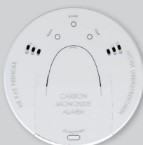
Carbon Monoxide Detector