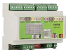
RBO408: Additional 8 relay board