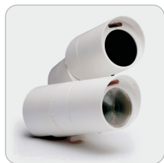
Additional Detector Pack