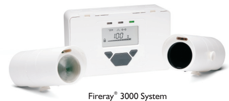
Fireray® 3000 System