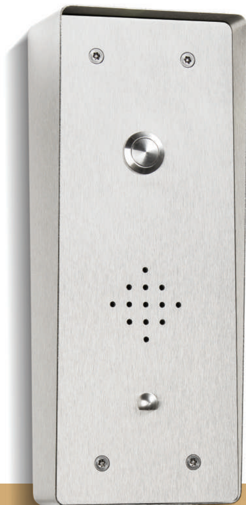
Model VRK1 1 way system

*Despite using the highest quality of 316 marine grade stainless steel panels can still be prone to tarnishing in some coastal locations or in areas of industrial pollution. If in doubt about the suitability of these panels in your area please contact us for advice.