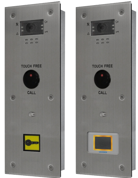
VR130 VIDEO NT SERIES + PROXIMITY