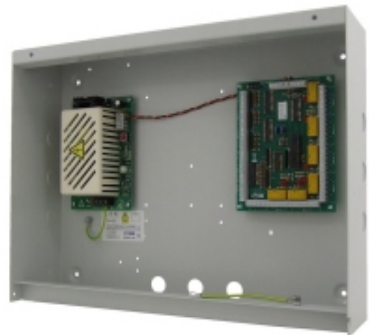
Dimensions 400 x 300 x 100mm