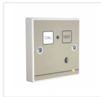
Quantec Addressable Infrared Call Point, Button...