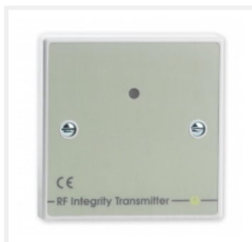
RF Integrity 'Heartbeat' Transmitter