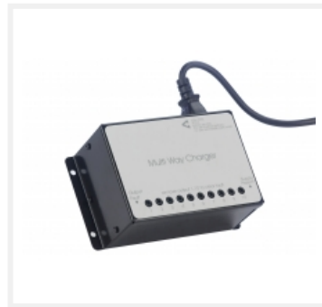
Ten Way Charger for QT412 Range Transmitters