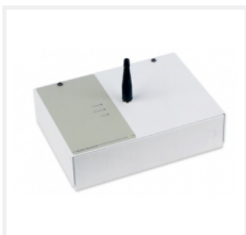
Quantec Radio Receiver