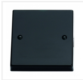
Quantec Slave Infrared Ceiling Receiver