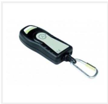
Rechargeable IR/RF Transmitter (push for call,...)