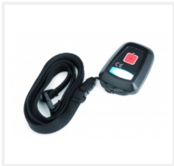
Infrared Attendance Pendant (push for attendance)