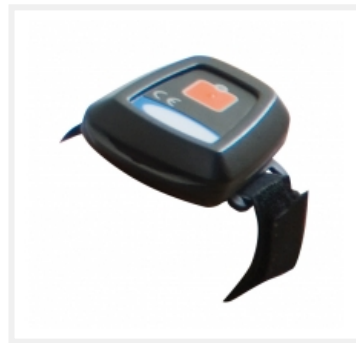
Infrared Patient Wrist Pendant (push for call)