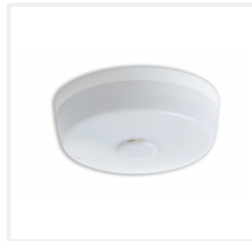
Quantec Slave Infrared Ceiling Receiver (Round...