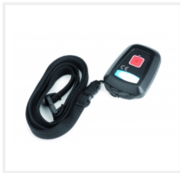
Infrared Patient Neck Pendant (push for call)