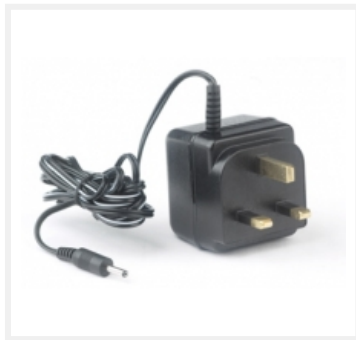
Single Way Charger for QT412 Range Transmitters