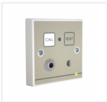
Quantec Addressable Infrared Call Point, Button...