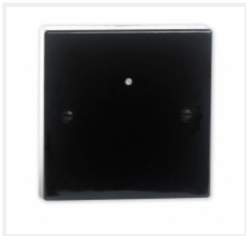
Quantec Master Infrared Ceiling Receiver