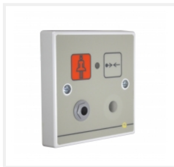
Quantec Addressable Infrared Call Point, Button...