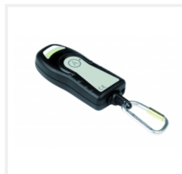
Rechargeable IR/RF Transmitter (push/pull for...