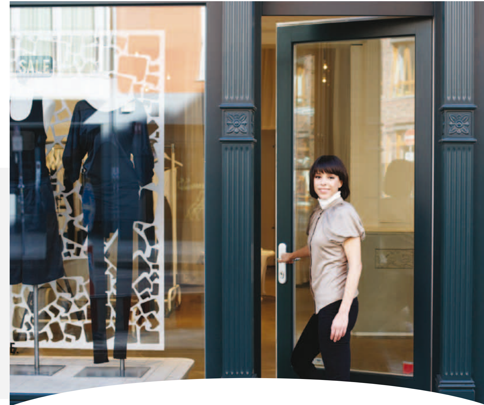
G2 ALARM CONTROL PANELS RANGE, BUILT ON GALAXY® TECHNOLOGY