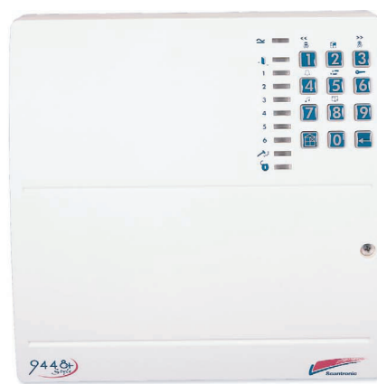
9448EUR-90 Style (on board keypad)