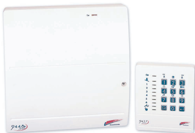
9448EUR-95 Style (remote keypad)