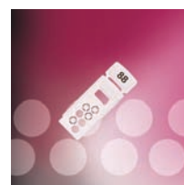
Patented XPERT Address Card