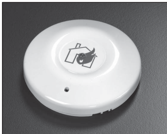
Part no: 53832-070

The MiniDisc Remote Indicator is polarity sensitive. Connect positive line to Terminal A or B and negative line to Terminal C (See table opposite)