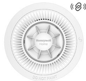
R200H-N Heat Alarm R200ST-N Smoke and Heat Alarm