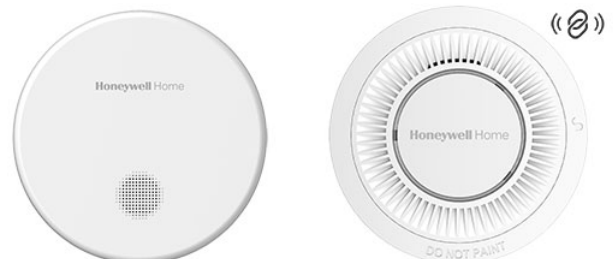
R200S Smoke Alarm