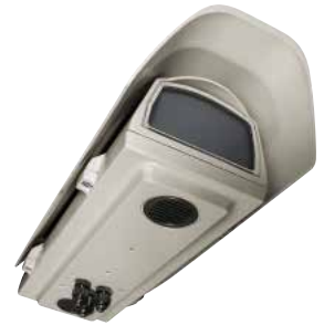
HOV + COOLING DEVICE