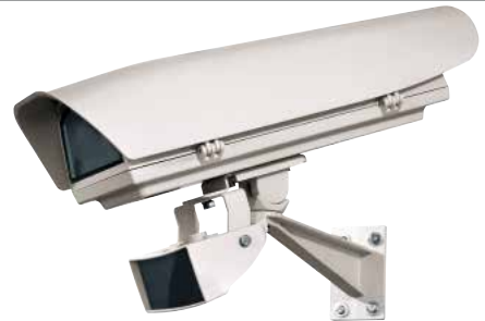
HOV + OSUPPIR + GEKO IRH + WBJA