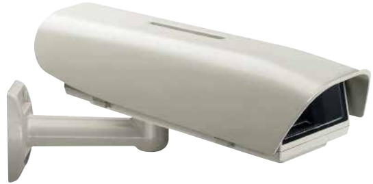
HOV + WBOVA2

Robust aluminium housing designed to simplify the installation and service and guarantee total protection against all environmental conditions. Its size makes it ideal for housing various combinations of standard cameras with fixed or compact zoom lenses. Very easy to install thanks to the side opening system that allows the full access to the camera, lenses and all internal connections. The numerous available accessories, like heater, camera power supply, blower and air filter, wiper and washer can satisfy any installation requirement.