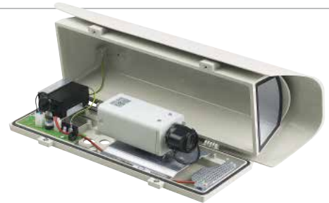
HOV + CAMERA