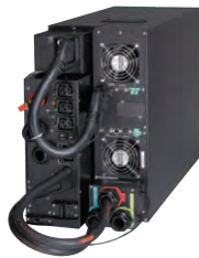
9PX 11kVA with Maintenance Bypass